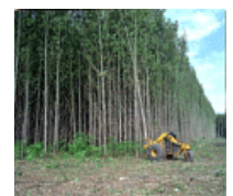
Wood from the trees