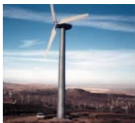
Power from the wind

Renewable resources can be used to generate electricity or to produce fuels , both of which can be used in exactly the same way as other resources such as coal, nuclear power, or gas. Renewable energy can provide power to farms, to rural enterprises, to homes and to offices. It is used for industrial processes, for heating , for powering electrical machinery , for transport , for lighting - in fact anything which requires energy.